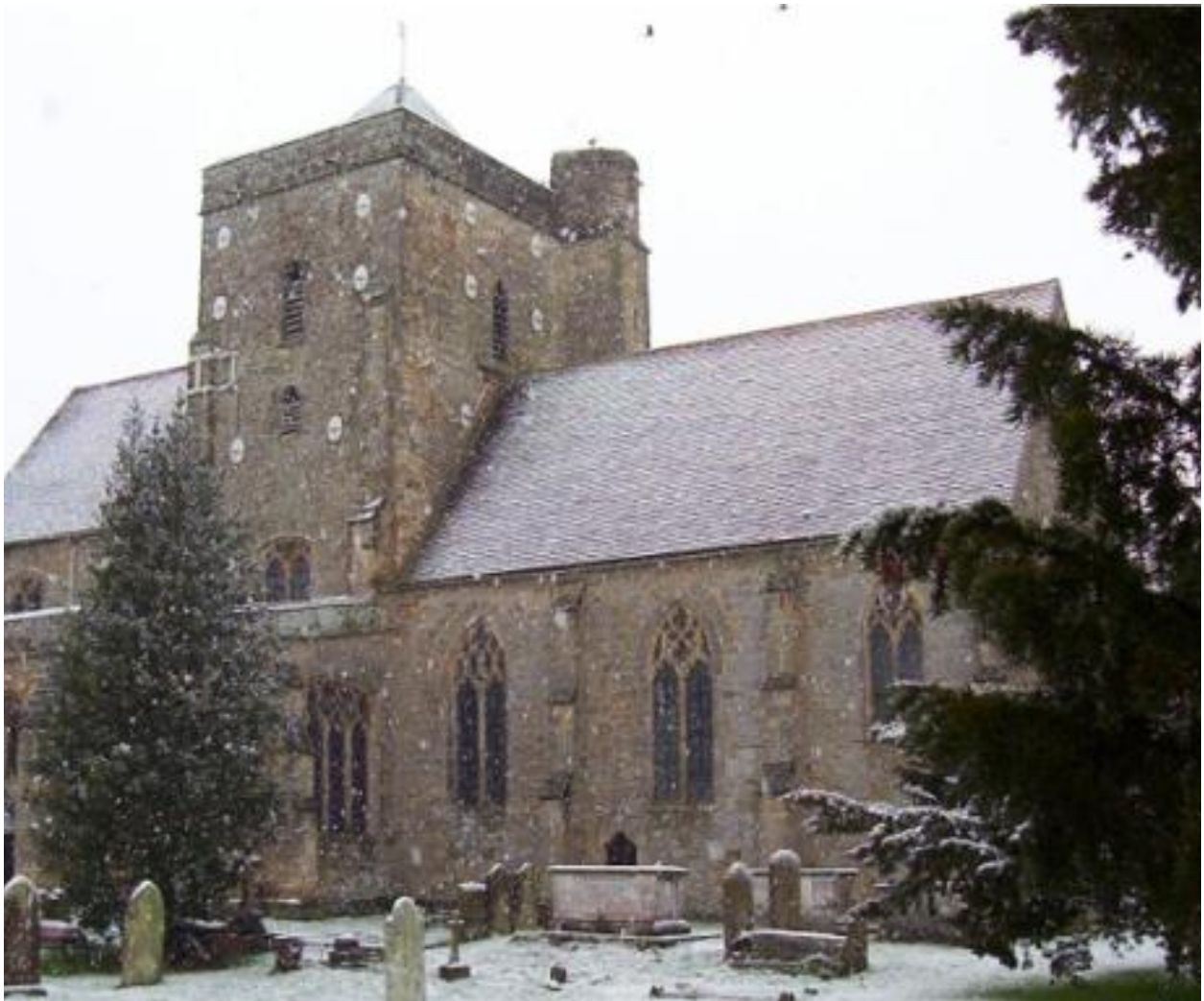
ECHYNGHAM CHURCH , ETCHINGHAM, SUSSEX, ENGLAND original about 1360